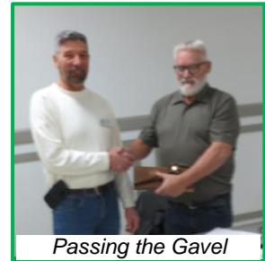
Passing the Gavel

Minutes of the previous meeting as circulated in Crankshaft Journal and a printed copy was displayed.