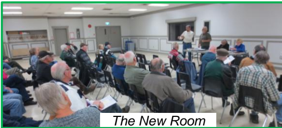
The New Room

It was noted that we will no longer be facing south (front of room) but East as a new audio/video system has been installed and speakers are now in the ceiling.