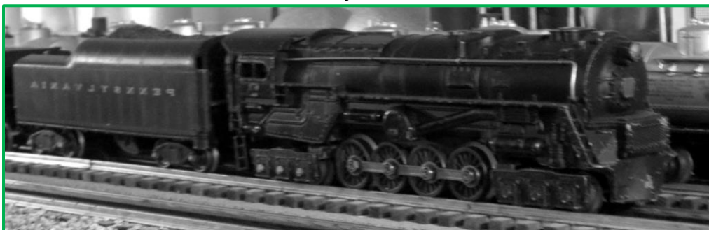
My 1952 "racing" Lionel Turbine (#671) loosely based on the above monster.