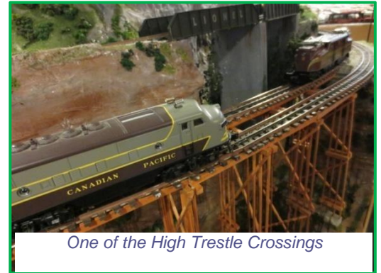
One of the High Trestle Crossings

For Christmas 1952 , I received from my Pop a Lionel steam engine, some cars, an oval of track plus a controller, all of which I still have and still play with. They were solidly constructed. In fact , I would put my poor model steam engine through hell at times, firing it up to full speed (20 volts) on straight track laid on the ground and letting it run off the end rails and crash along the concrete floor. And yet it runs just as well today as it did back then.