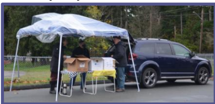
A great day, despite the weather!