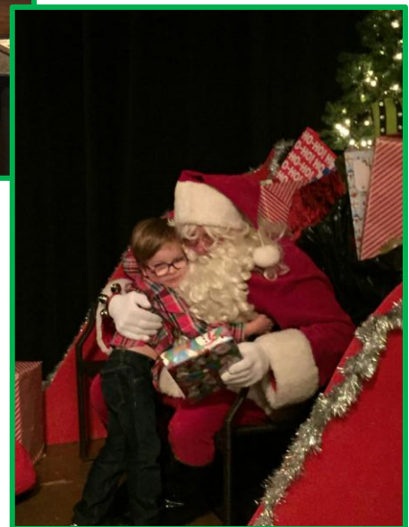
A Warm Hug for Santa