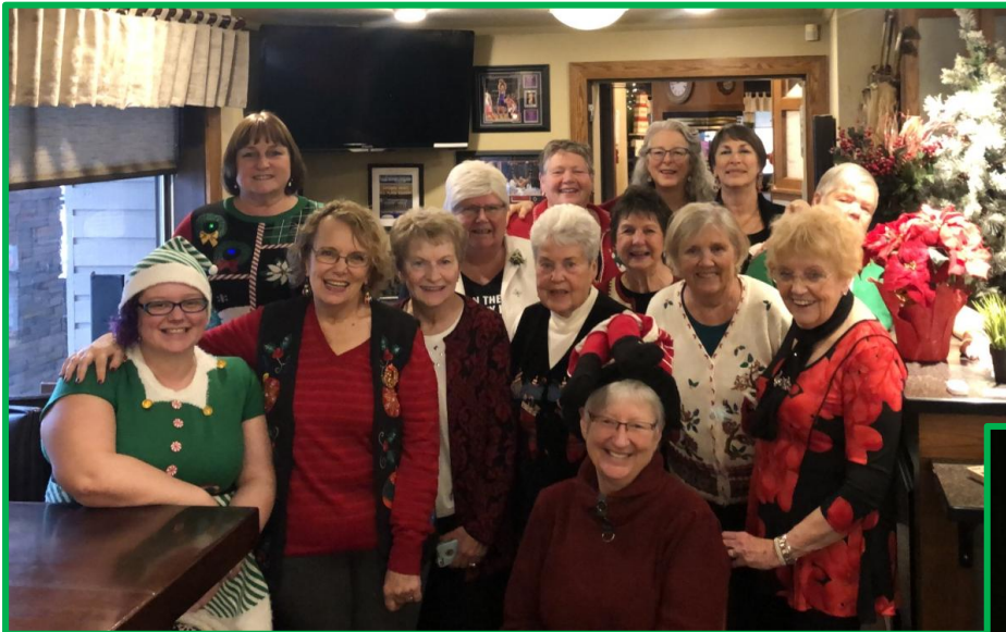
The Ladies December Christmas Breakfast