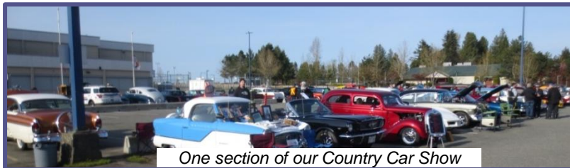
One section of our Country Car Show

Wow wasn't that a party?! Well sort of. I'm referring of course to our recent Country Car Show . After a two year hibernation, our 8 th annual Country Car Show was a great success. Many thanks to our member volunteers that came out to assist and support our Chapter's only fund raiser. Our Show's