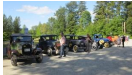
Model A Sunday