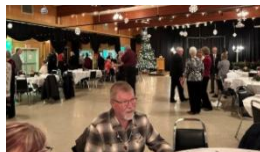
Our Christmas Banquet