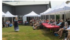
Our Annual BBQ