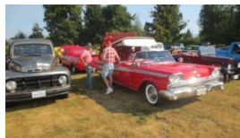
Mt. Lehman Fall Fair and Car Show