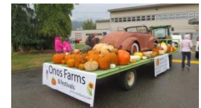
Agassiz Fall Fair and Parade