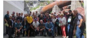
Tour to Stave Falls Hydro Electric Dam