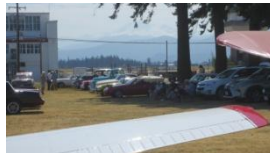
Wings and Wheels Car Show Celebrating Automotive Heritage Month