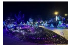
Lafarge Christmas Lights Tour