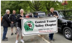
Fort Langley May Day Parade