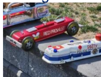
Golden Ears Valve Cover Races