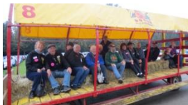
Aldor Acres Farm, Car Show and Hayride