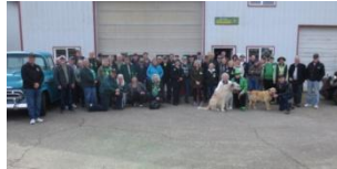
St. Patrick's Tour