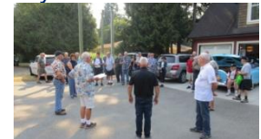
Two Garage Tours and the Canadian Museum of Flight in Langley