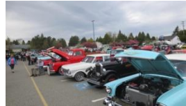
Country Car Show