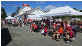
Mt. Lehman Canada Day Parade and Festivities