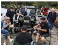
Falcon, Fairlane and Comet Show and Shine