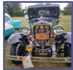
Dan's signature (since sold) Model A with all its badges