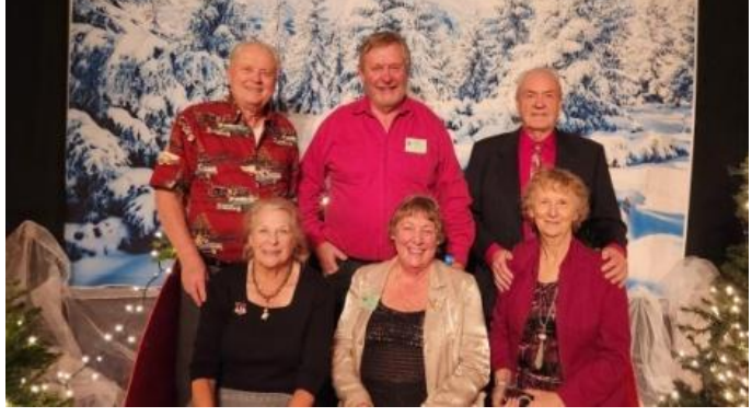
The Six Pack-Organizers Extrordinaire