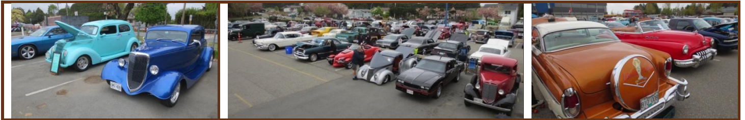
...more pics inside

Just some of the over 200 vehicles at our 11 th Annual Country Car Show. A roaring success