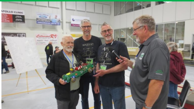
Fraser Field-awarded Jelly Bean sponsor's choice