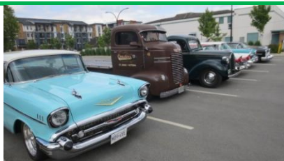
A few of the vehicles waiting patiently for the next tour to begin.

With Car Judging, Valve Cover Races, Great Tours and Great Food plus a whole lot more