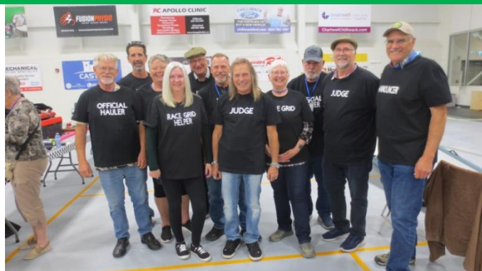
The Valve Cover Crew