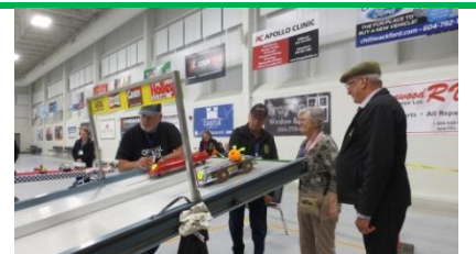
Action at the Valve Cover Races.