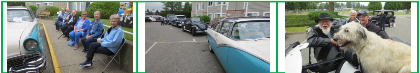
...more pics inside

A great little Show, a great little get together and a Fabulous BBQ