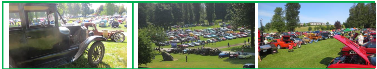
...more pics inside

Fine weather and a super fine display of cars, trucks and motorcycles