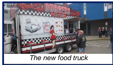
The new food truck