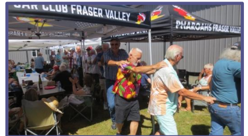
Great Food, Conga Lines and Elvis