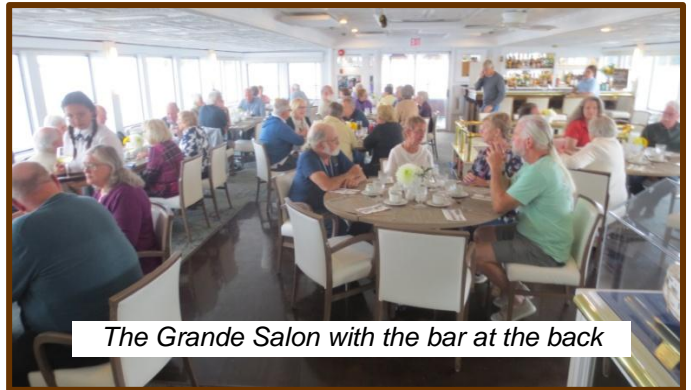
The Grande Salon with the bar at the back

Neither one of us had been through a lock system so that was a great experience. The total rise from Montreal to Kingston is approximately 246 feet through 7 locks. Amazing to watch.