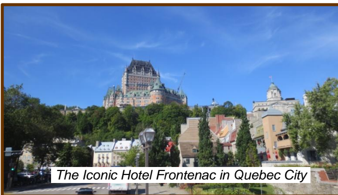
The Iconic Hotel Frontenac in Quebec City

The best parts of the cruise were the cruise of course, but also the people on board and the small size of the boat which measured 108 feet by 30 feet. A tiny hotel. Built in 1980 in the style of an old fashioned turn of the century classic Canadian River Boat, it had brass and