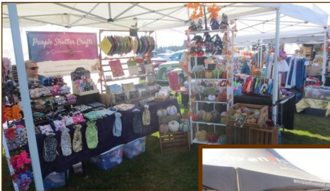
more pics inside