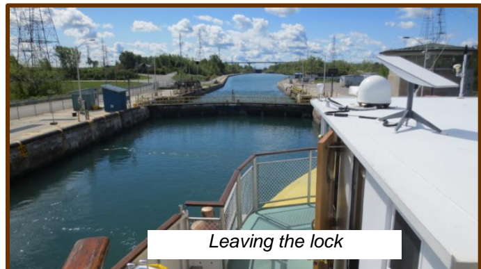
Leaving the lock