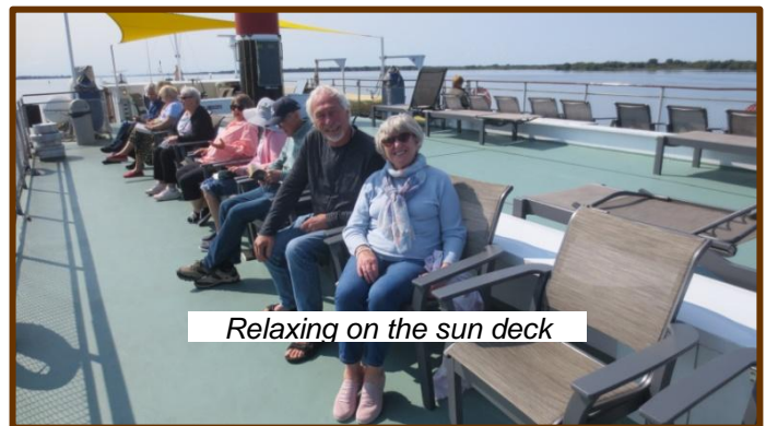
Relaxing on the sun deck