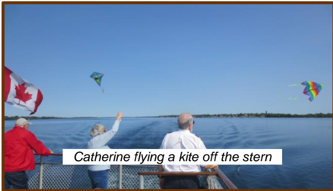
Catherine flying a kite off the stern

Our overnight stops were Trois Rivieres, Montreal, Cornwall, Brockville, Gananoque and Kingston. At each stop, there were tours arranged to various places that day and sometimes the following morning before we would cast off again.