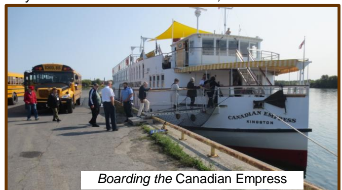
Boarding the Canadian Empress

We were 46 passengers on two of four levels and a crew of 13; five to look after the boat and the rest to look after us! Our rooms were made up and turned down each day and evening (including a chocolate).