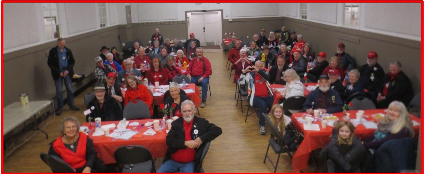
Another great crowd of Romantic Valentine Members at Mt. Lehman Hall looking very pleased after our lunch of hotdogs with a great choice of fixins, along with potato salad, cranberry juice, tea, coffee, water and more.